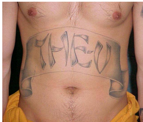
The V-Boys (Asian Gang) Tattoo