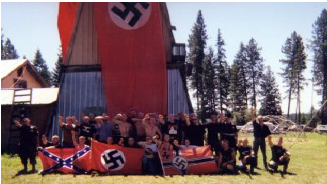
A Gathering of White-Supremacist Skinhead Gang Members

To justify an investigative stop or detention, the circumstances known or apparent to the officer must include specific and articulable facts causing the officer to suspect that (1) some activity relating to a crime has taken place or is occurring or about to occur and (2) the person the officer intends to stop or detain is involved in that activity, Terry v. Ohio , 392 U.S. 1, 21, supra . Further, evidence obtained during an illegal detention or arrest and evidence that is derived from initially illegally obtained evidence may be suppressed, Wong Sun v. United States , 371 U.S. 471 (1963). Derivative evidence, such as a photo identification of a suspect obtained from the use of evidence that was illegally obtained by the police explicitly for use in further criminal investigations (e.g., photos for gang books or field interview cards for gang databases), may be suppressed in court.