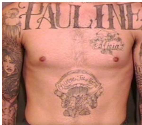
Hispanic Gang Tattoos

For a number of reasons, it is important to analyze and catalog the items seized in a “gang warrant” following the service of the warrant. First, it allows the magistrate who approved the warrant to determine that only items authorized in the warrant were seized. Second, although it is a tedious task, all of the seized letters need to be read, seized film developed, and seized tapes listened to, because their value depends on their content. Finally, a detailed inventory itemizing the evidence should be prepared for use in the instant case and for future use. Such an inventory allows for easy retrieval and should also be included in the gang intelligence files.