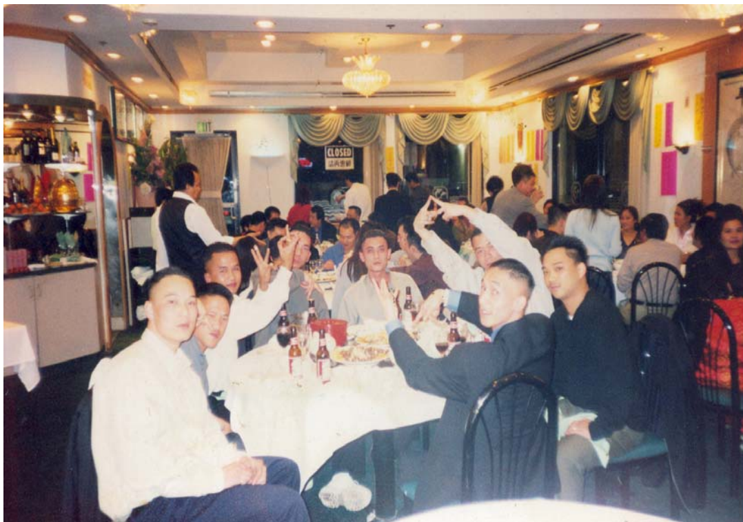
V-Boys (Asian Gang) Dressed Up for Party Flashing Hand Signs