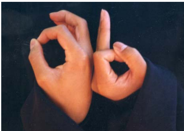
Asian Boyz (Asian Gang) Hand Sign

This documentation should also include examples of personal items, such as letters to and from various members in correctional facilities; other letters with gang reference; schoolwork; and phone books with reference to individual members’ names, monikers, and phone numbers. It is also important to document and catalog any and all examples of disrespect to rival gangs, newspaper articles of gang homicides or other felonious assaults, photos of crossed-out graffiti in public places, and personal items with negative references to rivals with names crossed out. All of these aforementioned items should be properly cataloged by gang name, with the date and time they were discovered, the locations where collected, and the names of the individuals, officers, deputies, or agents who collected the cataloged items.