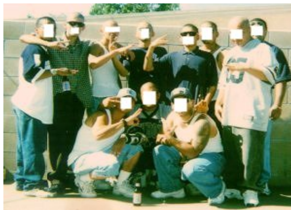
Juvenile Hispanic Gang Members

Under the guidelines in 28 CFR Part 23, Section (b)(6), information in an intelligence database must be evaluated for its relevance and importance at least every five years. Information not in compliance with the submission requirements should be purged, even if it is discovered to be noncompliant before five years. No information from the database should be disseminated without a legitimate law enforcement reason, such as a criminal case being filed against a suspect with information in the database.