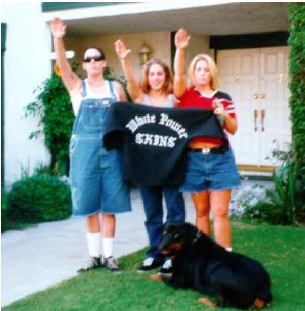
Female Racist Skinheads

gang and how it is known—not just that the member belongs to a gang but how that fact was established (self-admission, tattoos, clothing, or involvement with other self-admitted members in gang-related activity). Whatever the basis, it needs to be documented. Any self-admission should be in quotes: “I claim West Trece,” or “I was jumped into the Orphans,” or “I kick it with Asian Boyz.”