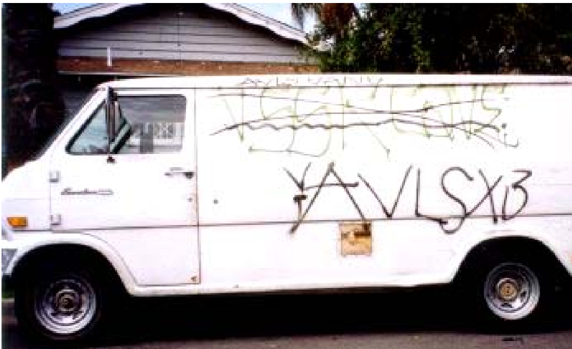
Hispanic Gang Graffiti on a Resident's Van